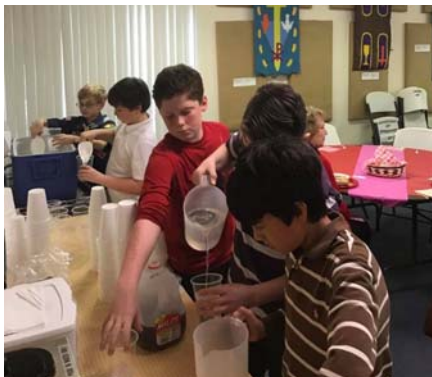
The boys serve drinks