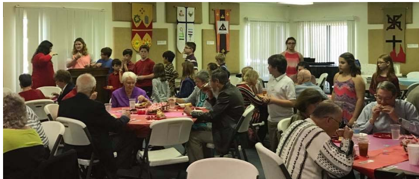
The Kids & Youth lead the blessing