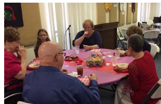
Table fellowship and conversation