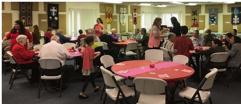
Youth and Kids serving "seasoned" members