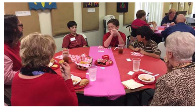
Boys share their point of view