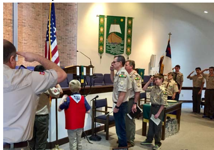
Scouts lead us in the Pledge of Allegiance