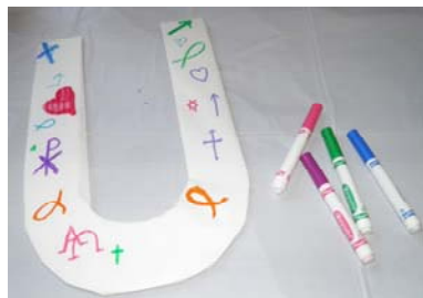
We are 'uplifted.' Jesus raised Lazarus and lifts us as well.

As we enter the sixth week of Lent remember the Prayer Centers keep changing each week to engage you on your Lenten Journey. If you have not visited a center during worship or during the week please make plans to in the days ahead, you might discover that the activities help focus your attention on God. The prayer centers are available to anyone during the week from 7:00am - 3:00pm...please come in for some quiet reflection in the middle of the Lenten season.