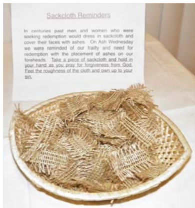
The burlap and broken pottery remind us of our brokenness.