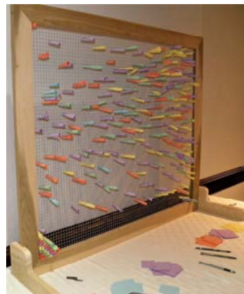
The prayer wall is filling up with petitions.

We still need lots of crosses decorated this week.