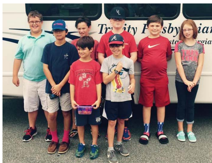
Our campers arrived safely at Dogwood Acres and we hope they have an awesome week with other campers from our Presbytery.