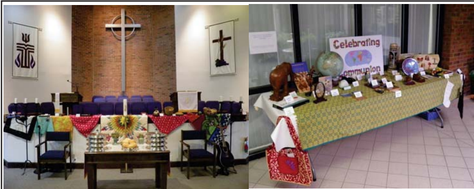
Thanks to all who contributed memorabilia from all over the world for World Communion Sunday. Items representing 5 of 7 continents were displayed. Thanks to the Worship Committee for arranging the display.