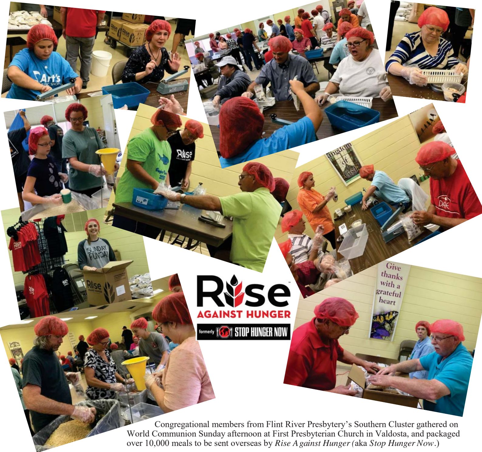
Congregational members from Flint River Presbytery's Southern Cluster gathered on World Communion Sunday afternoon at First Presbyterian Church in Valdosta, and packaged over 10,000 meals to be sent overseas by Rise Against Hunger (aka Stop Hunger Now.)

As Stewards, we will honor God by... Caring, serving, sharing His Holy Word.