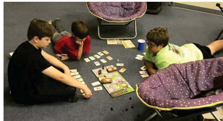
Last Friday night, the KOW families enjoyed a fun game night. Everyone played and fellowshiped together. The night ended with yummy root beer floats!