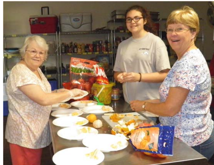
Snack Ladies hard at work.