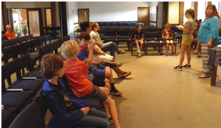
Opening devotional - Reading from the Book of Deuteronomy.