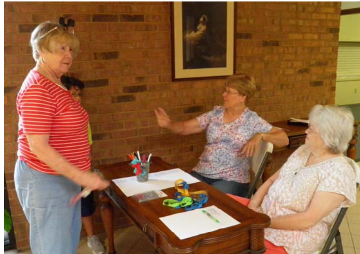
One of our campers is signed in at Registration.