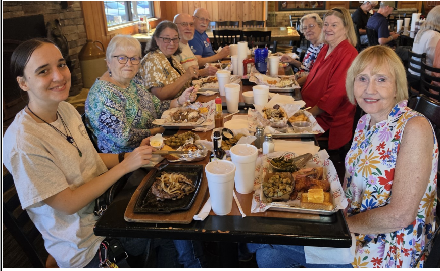
Dutch Lunch Bunch At The Smok'n Pig BBQ